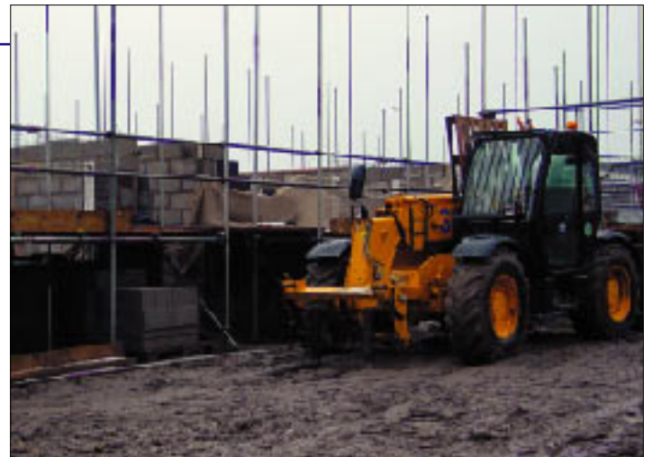
Work underway at the old Telegraph Station, Stanley Road