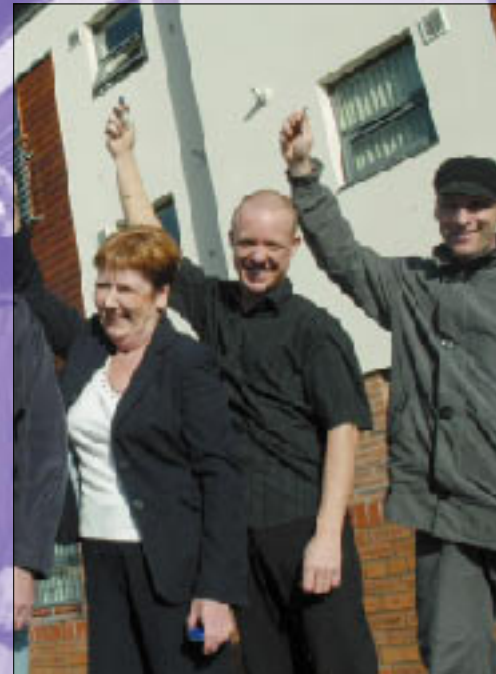
Highly Commended - 544 Stanley Road

Local residents and councillors who attended the event were very supportive and equally pleased that our area has been recognised. Many people commented on the good work we are doing and said how glad they are that LinacreOne was selected to work here.